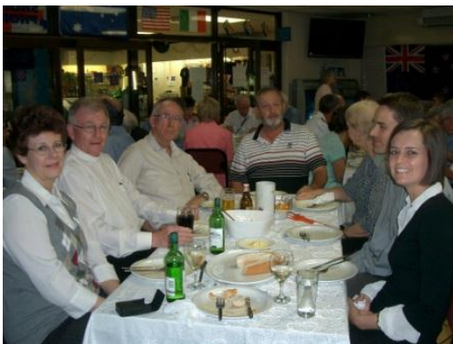
Guests enjoying lunch

We wish her Gods richest blessings for her future.