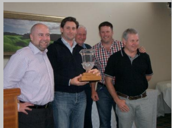
OACL - the winning team

This year the decision was taken to focus more on a social golf day, than one with prizes and raffles. We live in tough economic times, large companies included. The decision was welcomed and an enjoyable day was had by all.