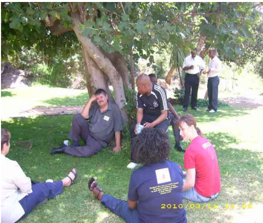
Enjoying a tea break.

The only thing that is asked of the Minister is obedience ; obedience to God and to the decisions of the Church taken under the promised guidance of the Holy Spirit.