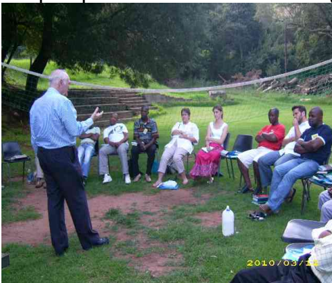
Church design is important.

The Probationers were evaluated in their sermon preparation and in their leading of worship and given constructive feedback. Other issues of priority included the study of passages of scripture with a view to sermon preparation.; an in-depth look at the sacraments of baptism and communion and a look at the standard Order of service from the perspective of Isaiah's meeting with the Lord (Isaiah 6:1-9).