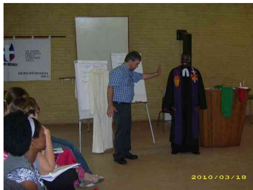
Go out ....preach & teach!

In order to familiarize Probationers with the structures of the UPCSA, a visit to the Central Office took place where they were able to meet each member of staff in his/her office and learn about their particular responsibilities and challenges. Later the same day a visit to Constitution Hill took place. It is a site encompassing both the sad and unfortunate past of the Apartheid era as well as the hope for a just future. The Probationers therefore had the opportunity to visit the prison cells where some prominent men and women were held and also had the opportunity to see the Constitutional Court, the highest decision making body of the land.