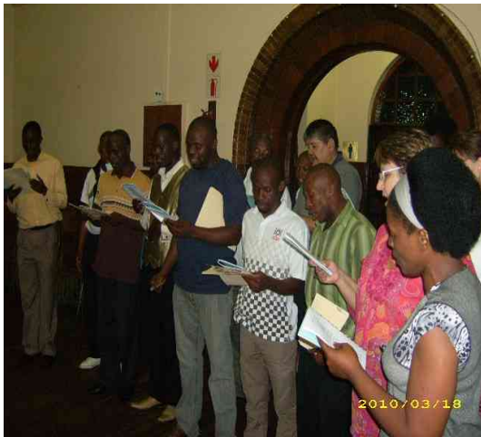
Singing a Zambian song at St Columbas.

Some of the comments received from Probationers included: “This Probation conference was like a year at university condensed into two weeks.”; “ In the Probation week I have really felt and seen the oneness and unity of the church of God.”; “Thank you so much for giving us an opportunity to grow. The conference brought so many different gifted people into our midst that we will be able to view our ministry in a broad way.”; “The choice of programme topics and of speakers was brilliant.”; “Could we have more time on sermon preparation and also time to reflect on and digest all the information that we received.”